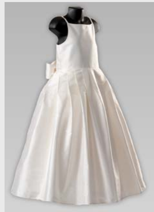
Georgia - Shallow scoop neck thin strap bodice. Directional tuck skirt. Shown in bridal white silk.