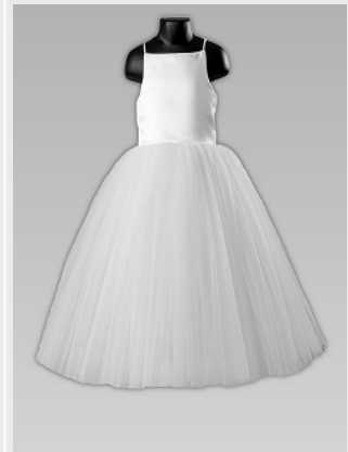
Melissa - Shallow scoop thin strap bodice. 2 layer tulle skirt. Shown in white satin.