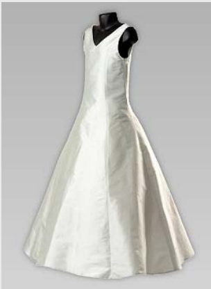
Olivia - This is a 1 piece gown. V neck sleeveless bodice. Six panel skirt. Gown shown in soft green silk.