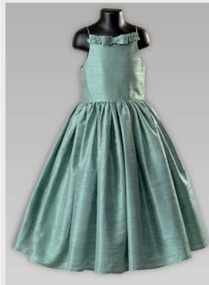
Julia - Shallow scoop thin strap bodice with ruffle bow trim. Full gathered skirt. Shown in teal silk.