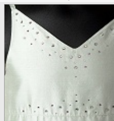
Crystal & Pearl Bodice Trim Option