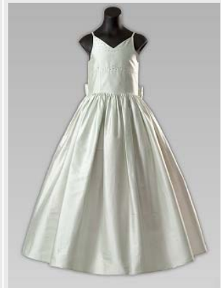
Amelia - Sweet heart neckline thin strap bodice. Full gathered skirt. Shown in soft green silk with crystal bead bodice trim.