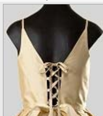
Thin Strap Lace-Up Back Option