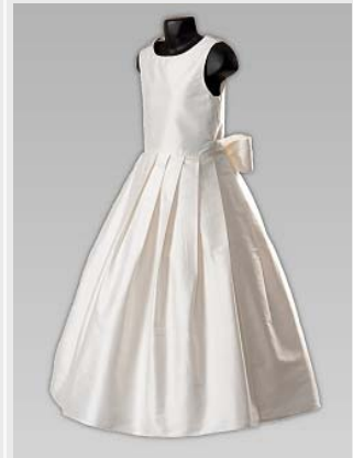
Tarah - Shallow round neck sleeveless bodice. Directional tuck skirt. Shown in ivory silk.