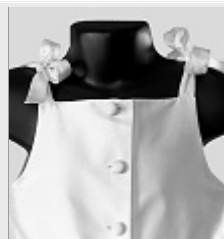
Shoulder Ribbon Bows Option