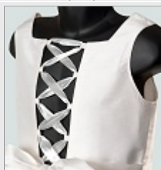
Sleeveless Lace-Up Back Option