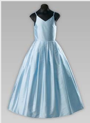
Charlotte - V neck thin strap bodice with lace-up back. Directional tuck skirt. Shown in ice blue silk.