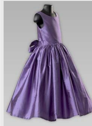
Rebecca - Scoop round neck sleeveless bodice. Full gathered skirt. Shown in rich mauve silk.