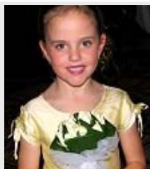
Cap Sleeve Option

Skirt options include a single layer organza overlay. Please Note: All gowns are lined and include a petticoat.