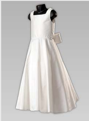
Natasha - Square neck sleeveless lace-up back bodice. Half circle skirt. Shown in bridal white silk.