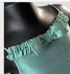
Ruffle Bow Bodice Trim Option