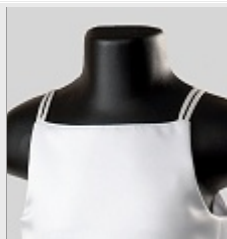
Double Shoulder Strap Option