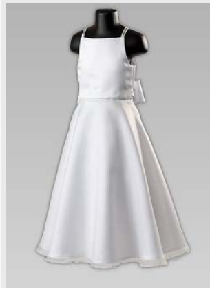
Abbey - Shallow scoop double thin strap bodice. Half circle skirt with organza overlay. Shown in bridal white satin.